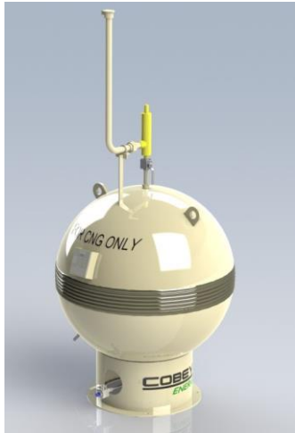
CE-VR Single Vessel

Cobey Energy CNG ASME Vessels standard offerings include: